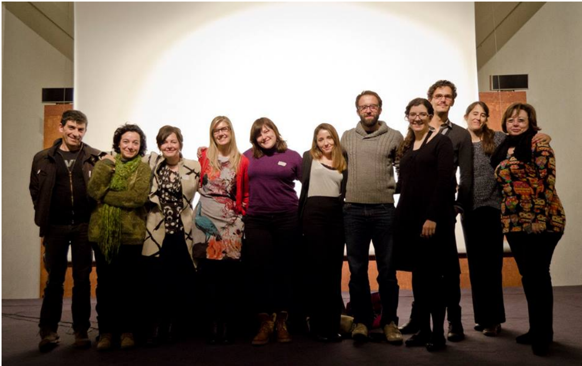
Acre IV General Assembly Committee and Members

https://es.scribd.com/doc/241092946/Novedades-de-ECCO-pdf