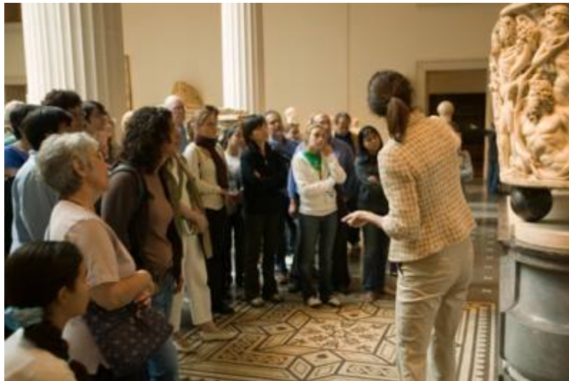
Guided tour Restored Heritage by Urdimbre

Since the beginning of ACRE creation, the Association has been contributed to the improvement of the profession of conservator-restorer of cultural goods as a priority, trying to achieve and manage our own jobs. The “Urdimbre” Project has achieved it, and has employed two-three conservator-restorers, thank to the Culture Ministry grants.