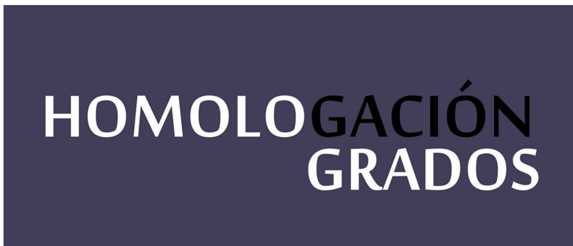
Publicity Campaign Word game: "Homologados + Grados= homologados," Homologated + Grades.